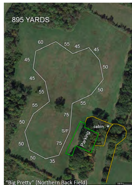
Saturday — 895 yards December 26, 2020