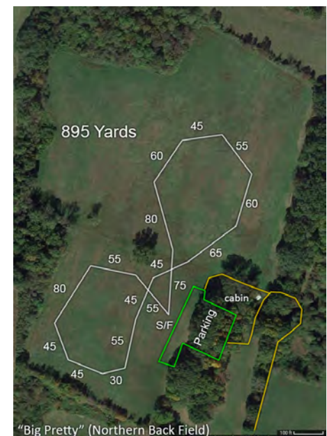
Sunday — 895 yards December 27, 2020