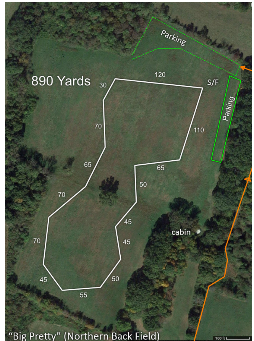
Monday — 890 yards December 28, 2020