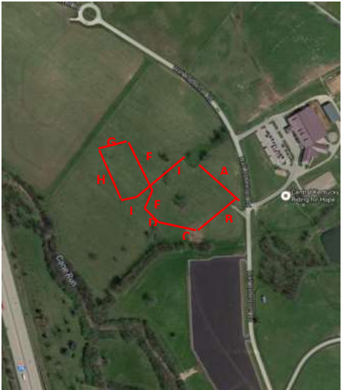
Thursday and Saturday's Course